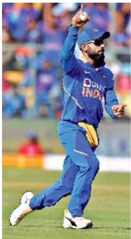
Virat Kohli, wearing sunglasses, celebrates after taking a catch.