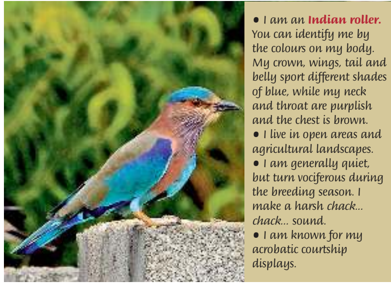
S. R. RAGHUNATHAN

• I am an Indian roller . You can identify me by the colours on my body. My crown, wings, tail and belly sport different shades of blue, while my neck and throat are purplish and the chest is brown. • I live in open areas and agricultural landscapes. • I am generally quiet, but turn vociferous during the breeding season. I make a harsh chack... chack... sound. • I am known for my acrobatic courtship displays.